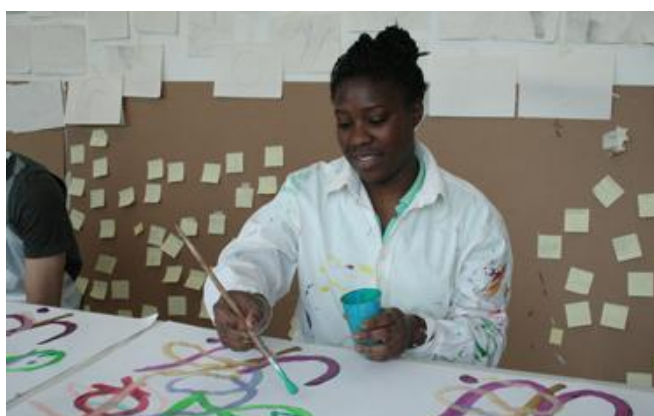
Leader of HART CULTURE C.I.C. Foundation at the Serpentine Gallery, Royal Borough of Kensington.

For larger outdoor murals that require specialist paint, we usually buy these in the 'overall budget'.