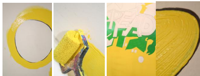
Mural painting themes, techniques and tool used in the Playground. A selection of 'weather resistant paint' was also used to help preserve artwork better. Up to 5 main colors were used and then mixed to achieve a wider variety and economize on

For larger outdoor murals that require specialist paint, we usually buy these in the 'overall budget'.